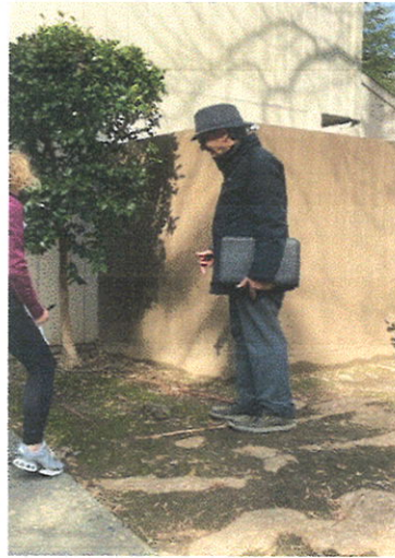
307 Dunbarton Side yard at corner of alley and Elmhurst