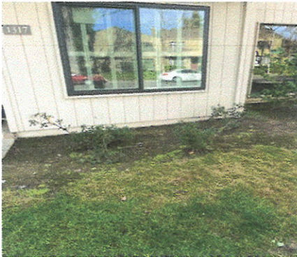
1317 Vanderbilt Right side of front door