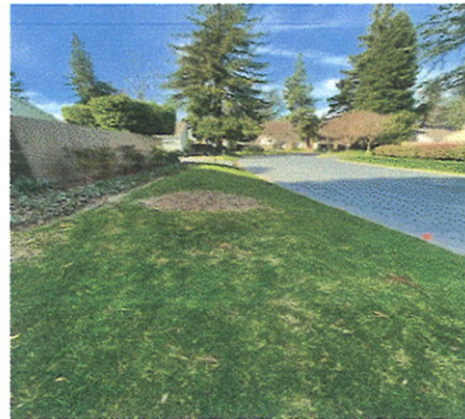
510 Elmhurst Photo 2