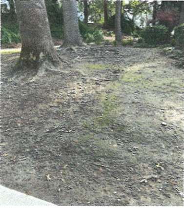
1653 Photo 2