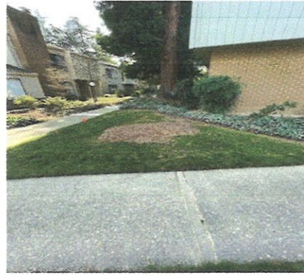
510 Elmhurst Photo 1