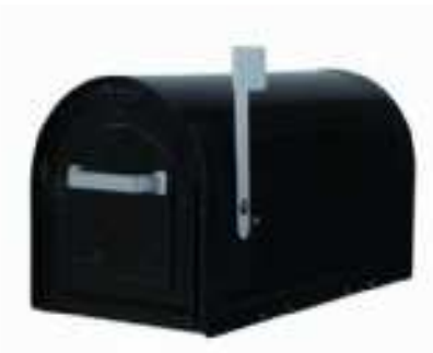
Solar Group WM16KB01 Large Lockable Decorative Mailbox, Black