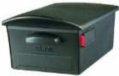
Solar Group RSKB0000 Curbside Locking Mailbox