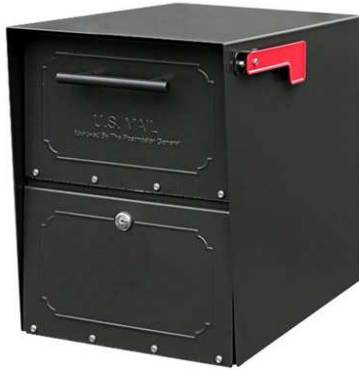
Architectural Mailboxes 6200B-10 Oasis Jr. Locking Post Mount Mailbox, Black