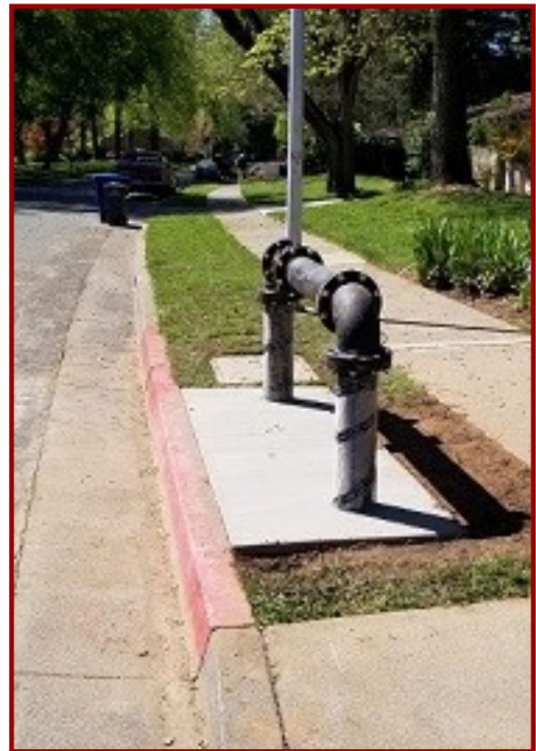
Typical above-ground meter.

As stated earlier, the work is expected to be completed by April 30 th barring any unforeseen difficulties. Please contact management if you have any further questions.