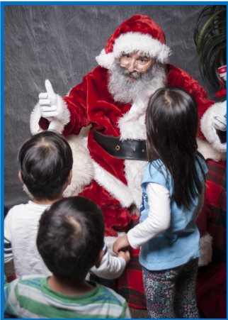
Santa tells the story about That Foggy Christmas Eve...