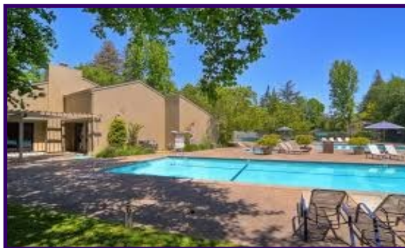
The pool at The Nepenthe Clubhouse.